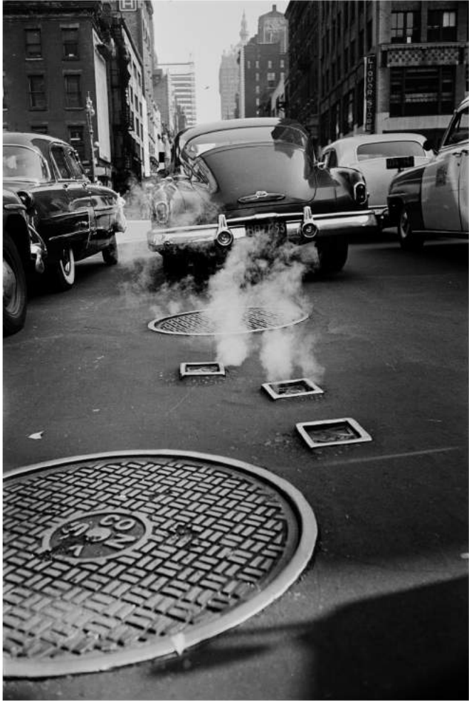
Steam escapes, New York, USA 1953