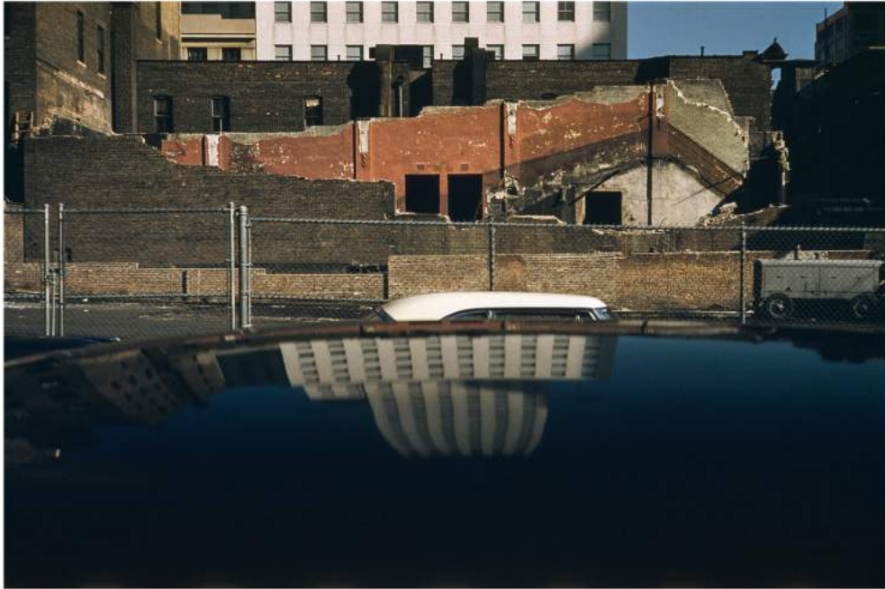
Reflecting house, New York, USA 1953