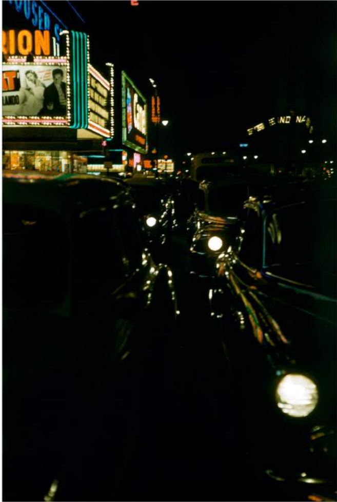
Cruising at Night #1, New York, USA 1953