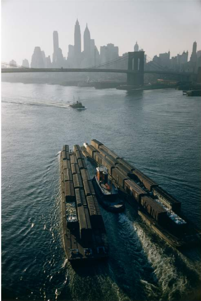
Tugboat and barges, New York, USA 1953