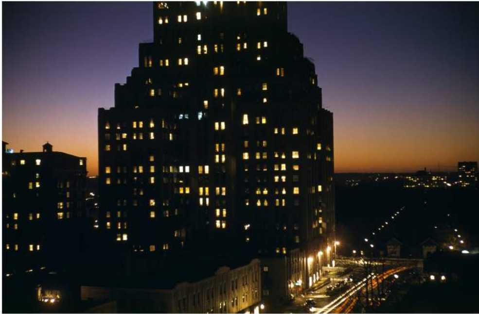
Building with lights, Chicago, USA 1953