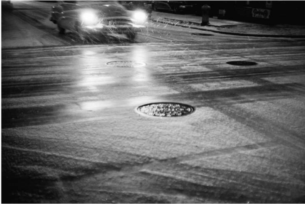
Car in snowfall, New York, USA 1953