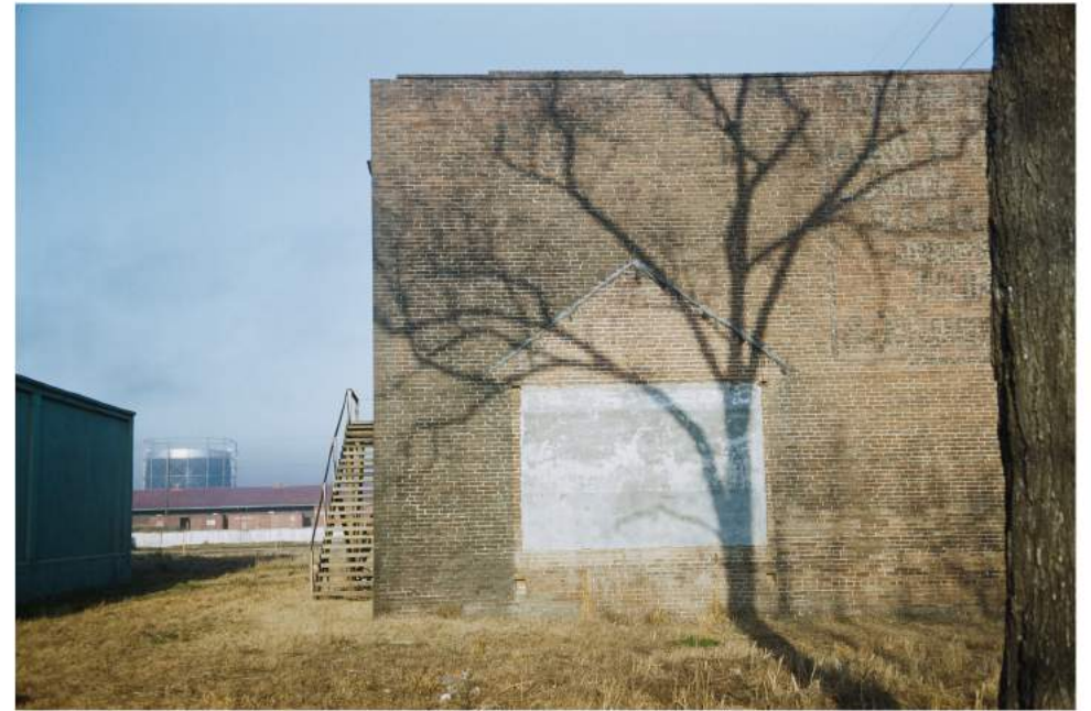
A tree's shadow, Georgia, USA 1953