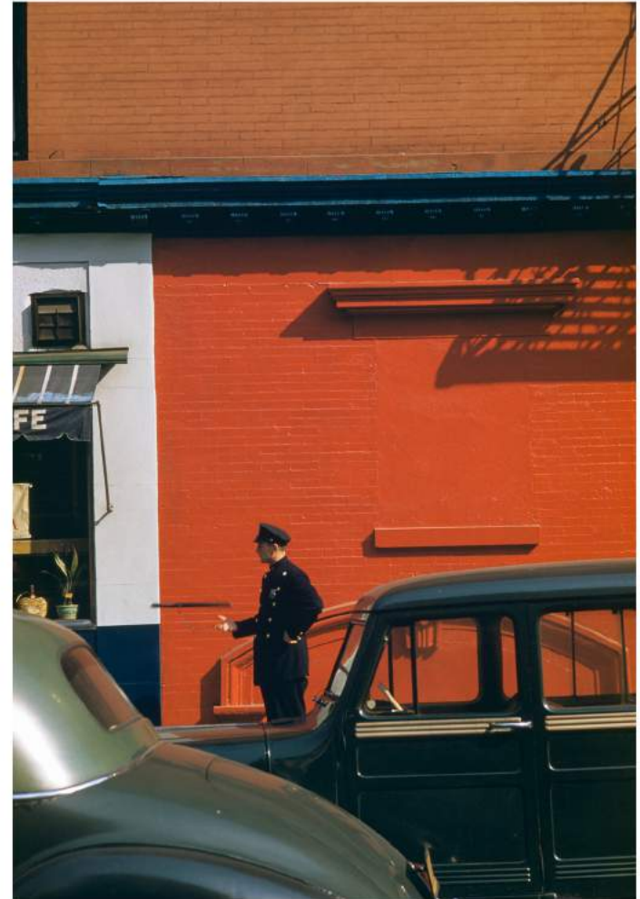
Cop tossing night stick, New York City, USA, 1953