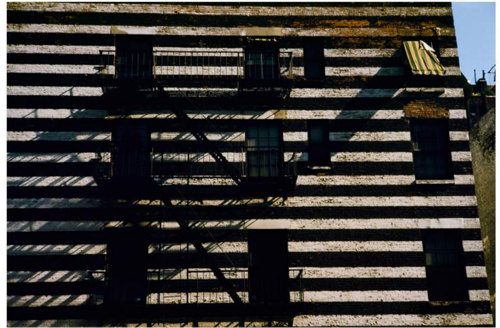
Shades and, New York, USA 1953