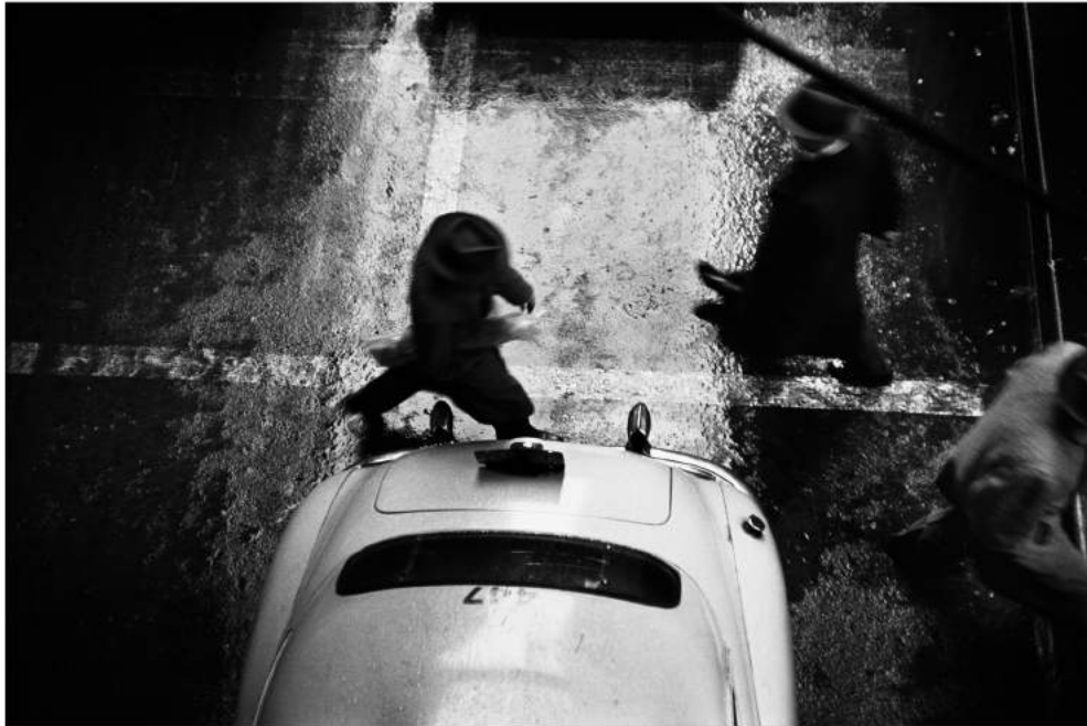
Madison, New York, USA 1953