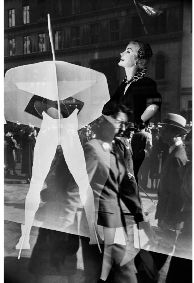
Reflection in store window, New York, USA 1953