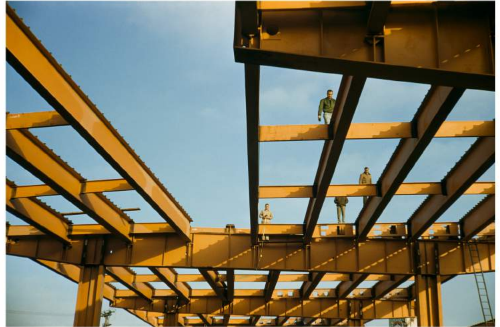
Highway construction, San Francisco, USA 1953