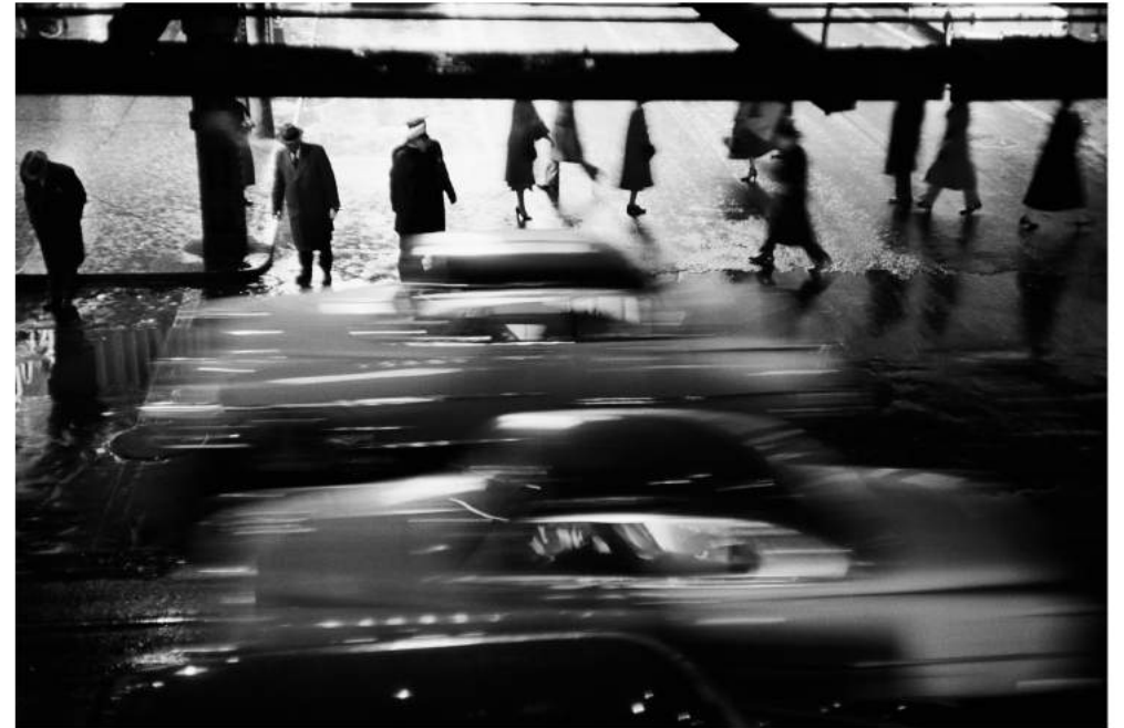
Rushing cars, New York, USA 1953