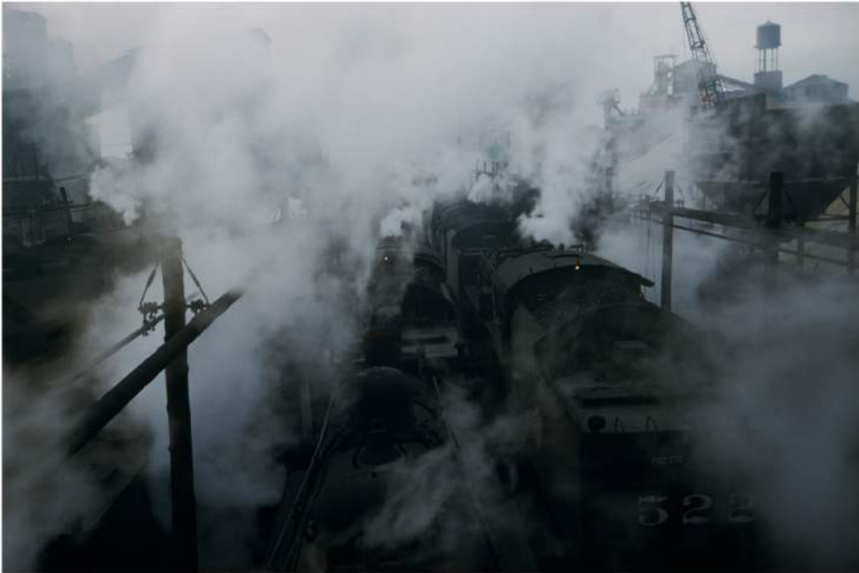
Steam train, Chicago, USA, 1953