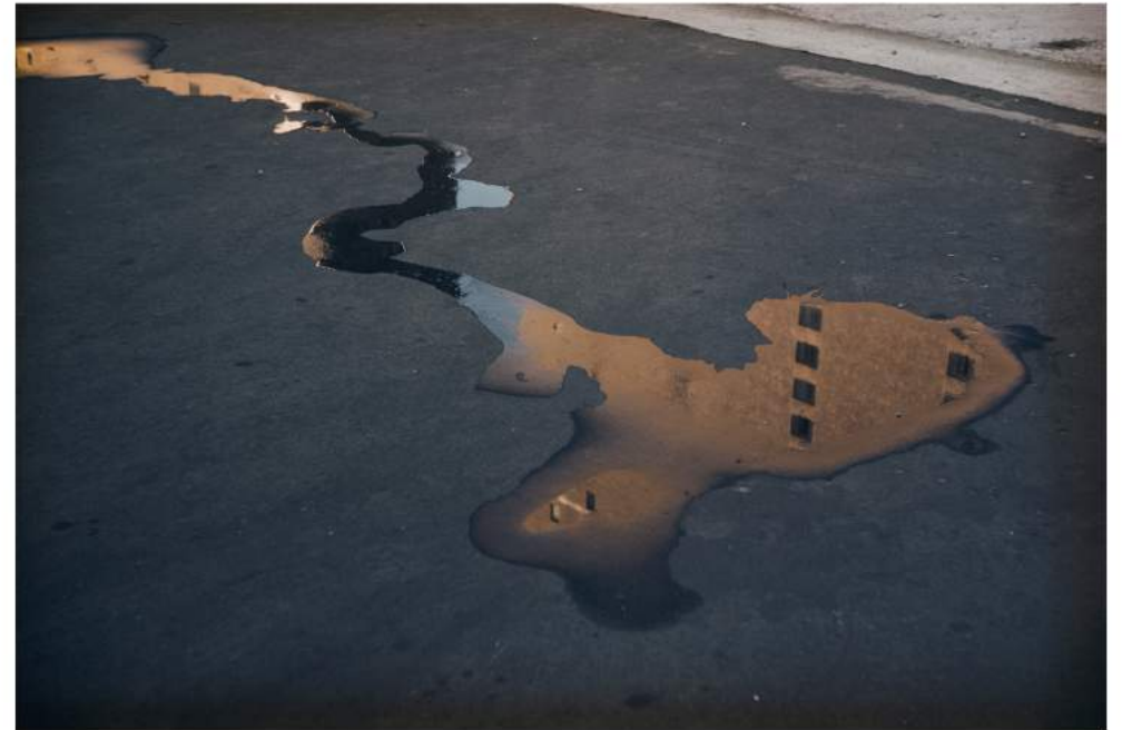
Reflection in water, New York, USA 1953