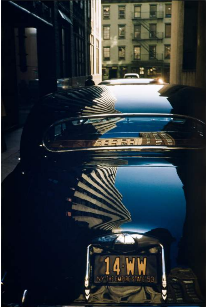
Reflection on a Jaguar, New York, USA 1953