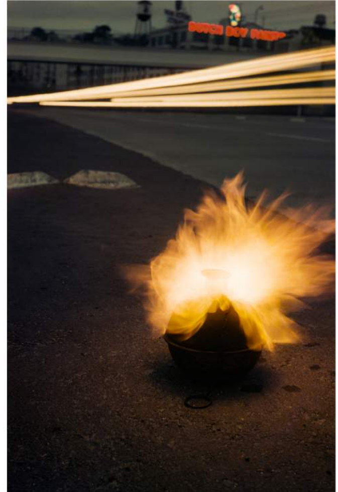
Fireball, Chicago, USA 1953