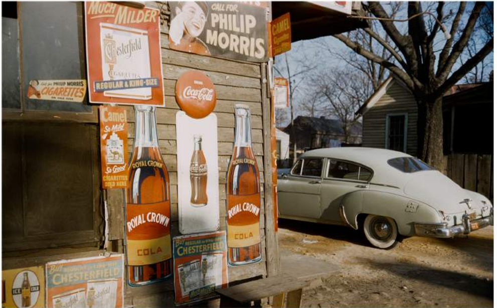
Advertising signage, southern states, USA 1954