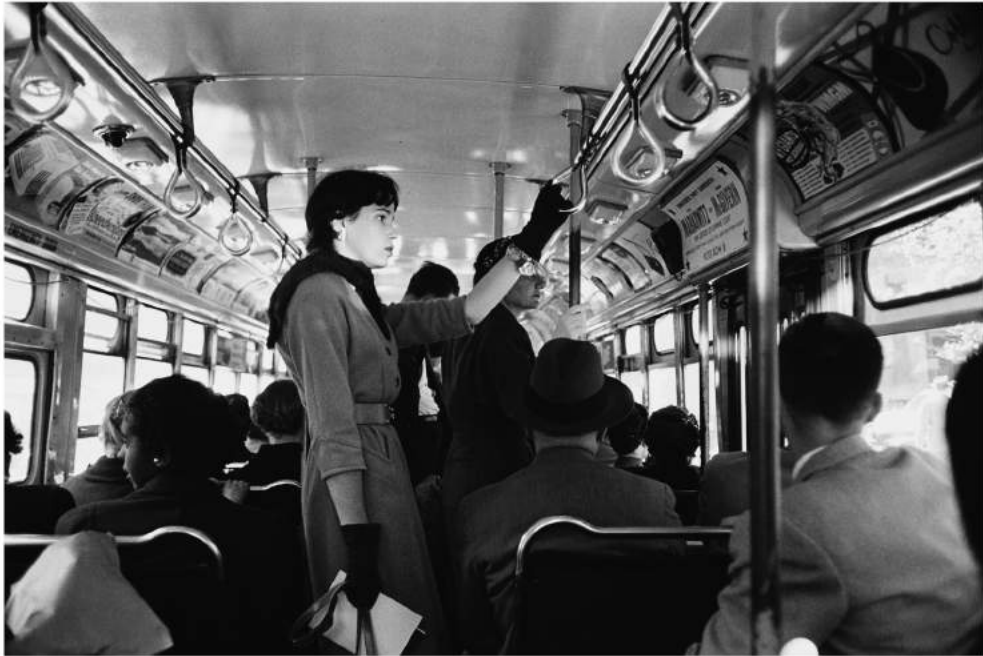
Bus commute, New York, USA 1953