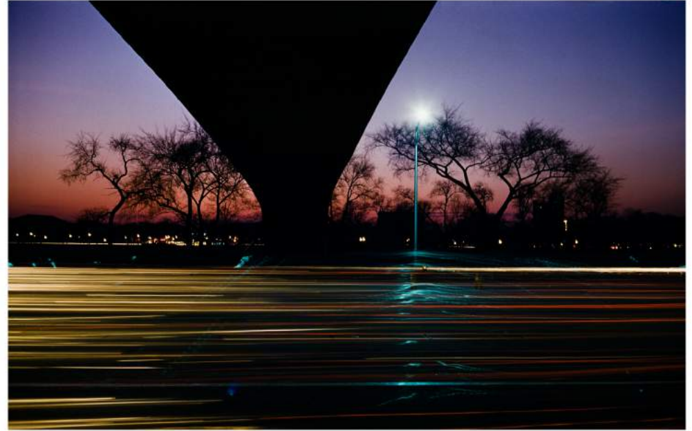
Lake Shore Drive, Chicago, USA 1953