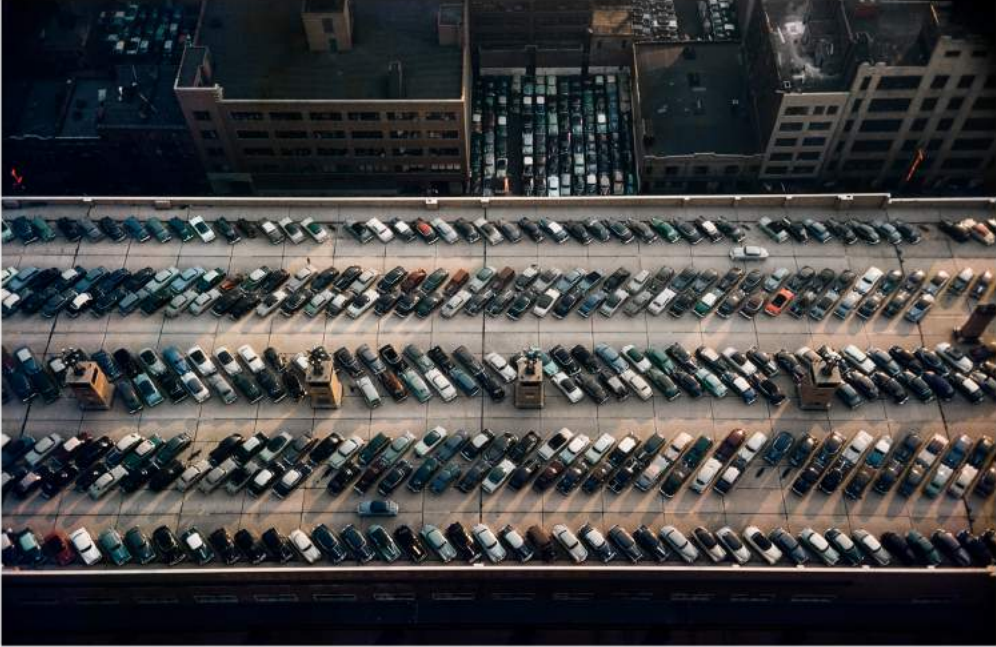
Roof of the bus terminal, New York, USA 1953