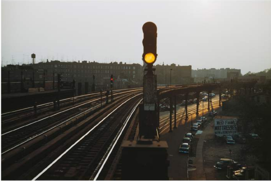
Subway signal, New York, USA 1953