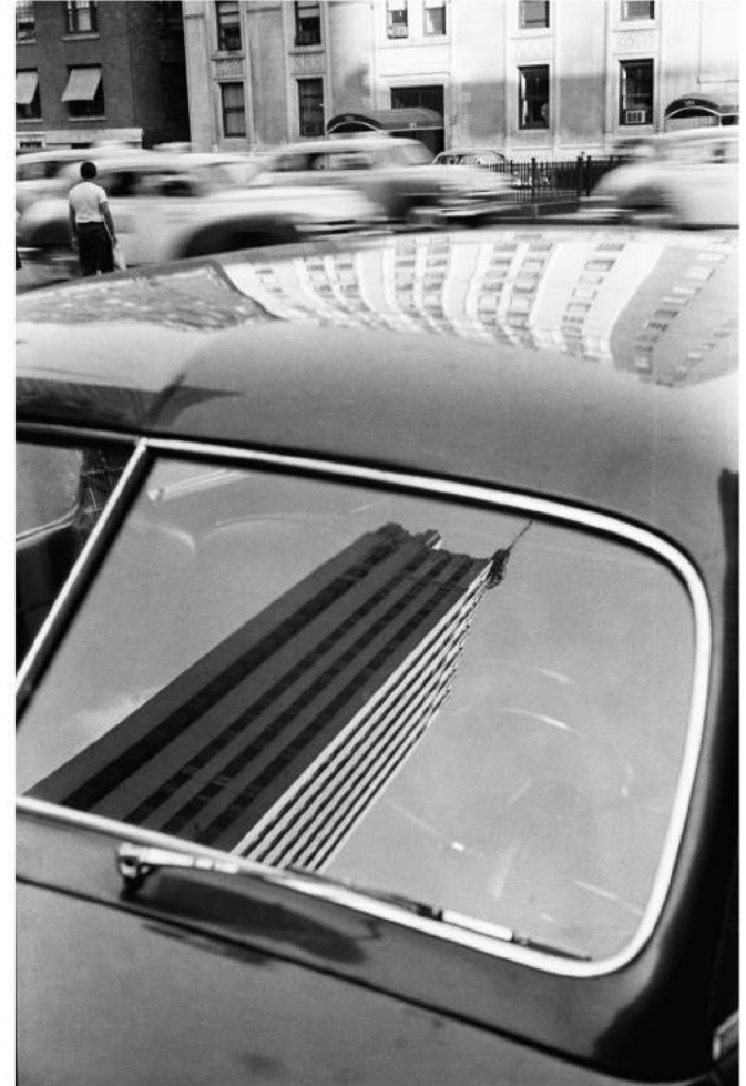
Reflection in car windscreen, New York, USA 1953