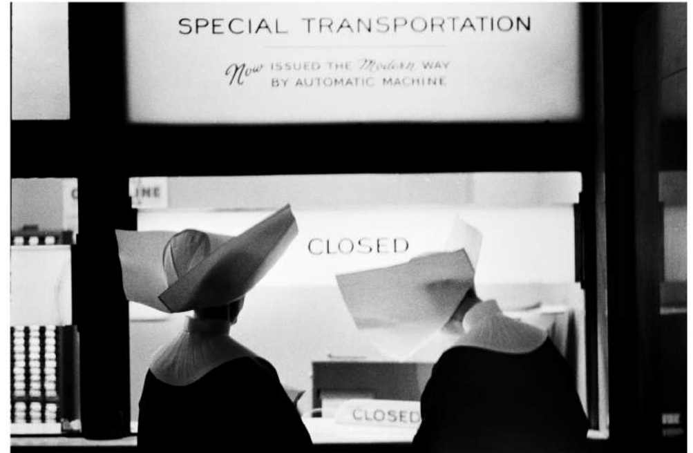
Two nuns, New York, USA 1953