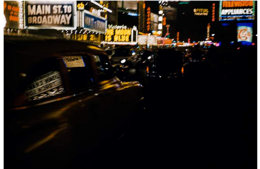
Cruising at night #2, New York, USA 1953